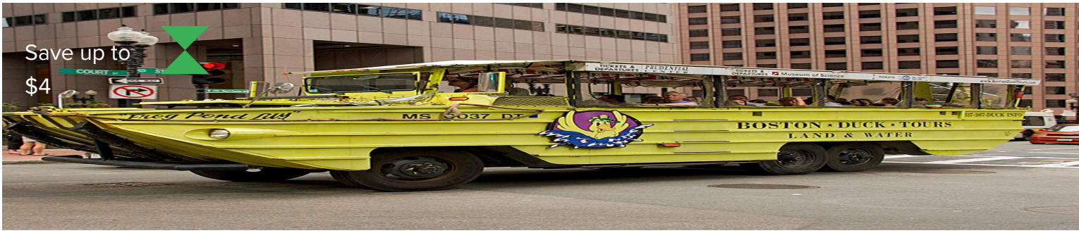
Boston Duck Tour