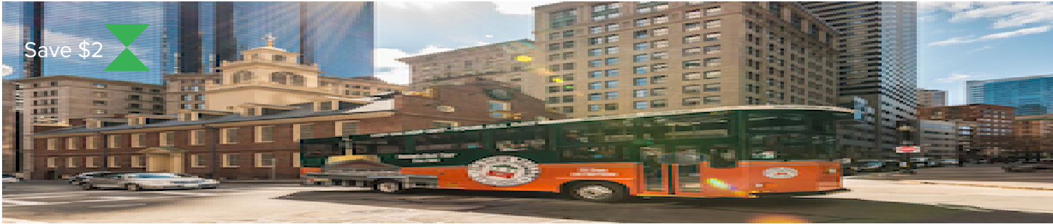
Boston Old Town Trolley 1-Day Ticket (Gold Pass)