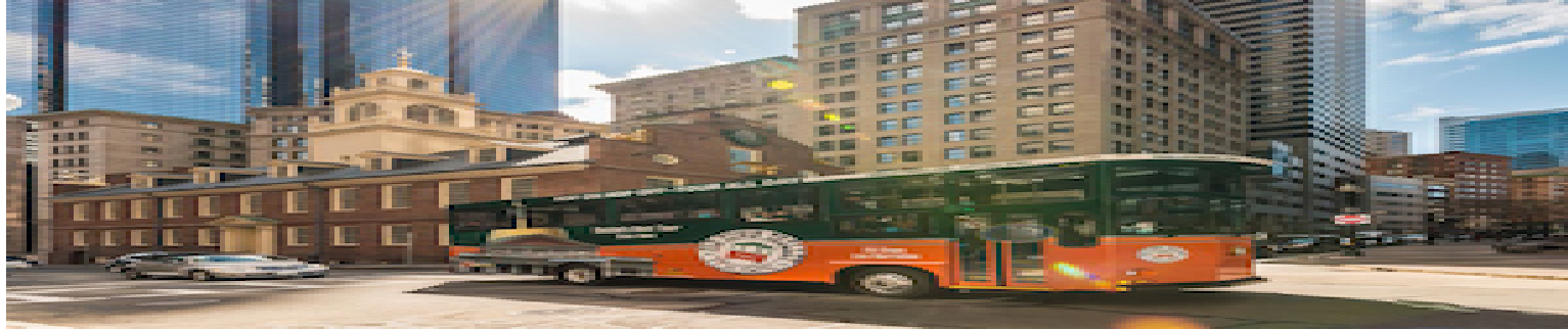
Boston Old Town Trolley 2-Day Ticket (Platinum Pass)