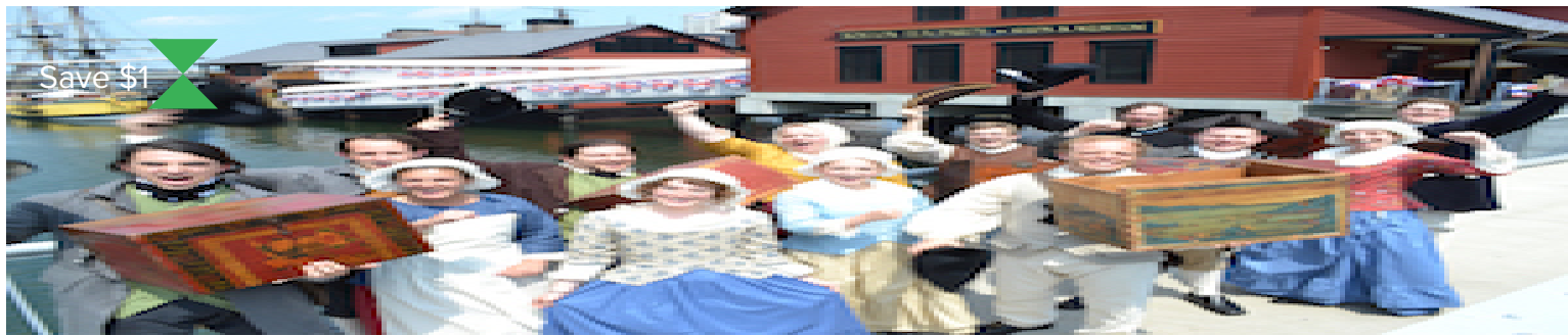
Boston Tea Party Ships and Museum