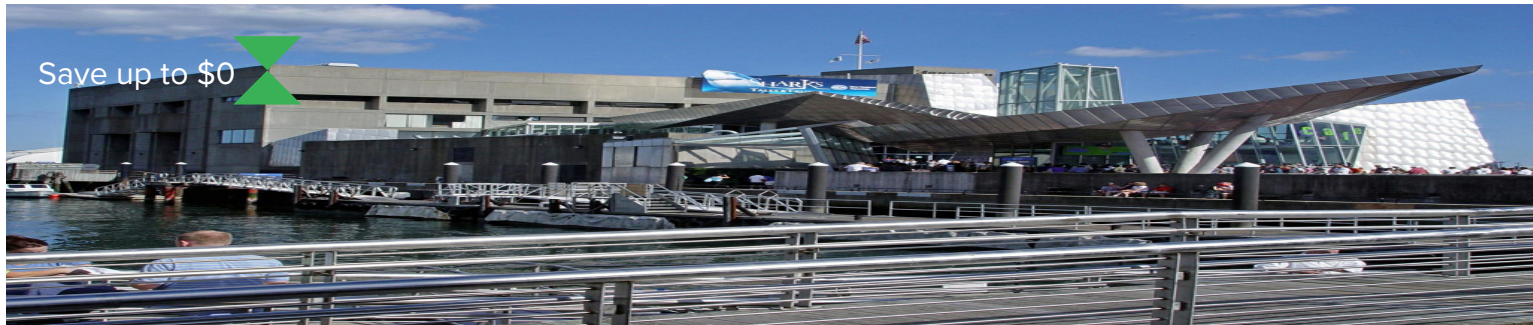
New England Aquarium