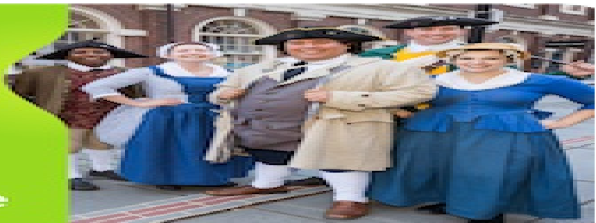
Boston 2 Day Go Card