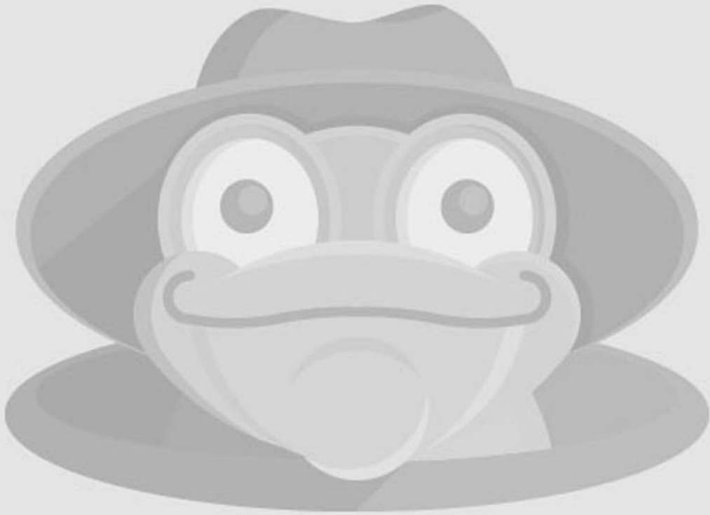
The Drake Hotel a Hilton Property