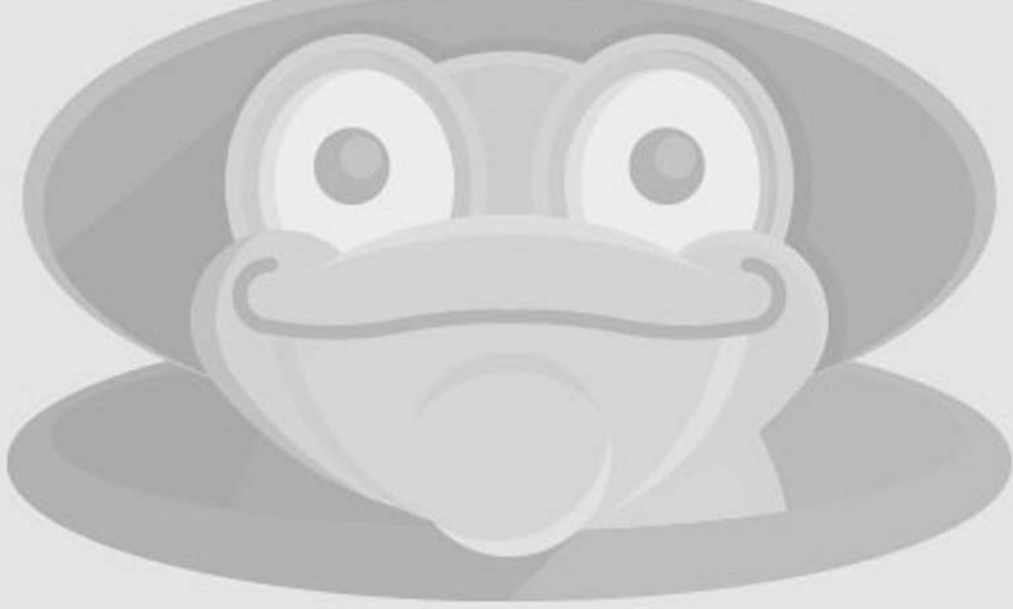
iFLY Indoor Skydiving - Fort Lauderdale