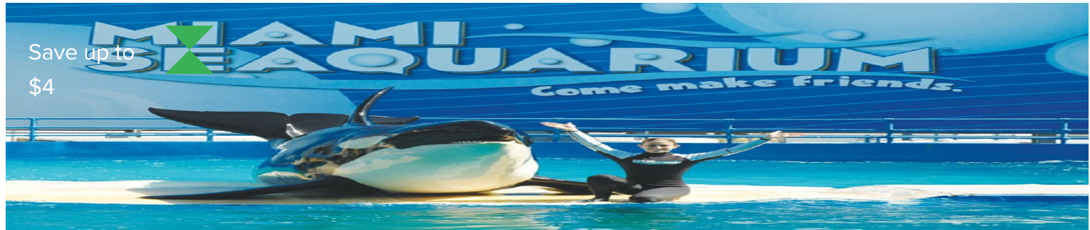
Miami Seaquarium General Admission