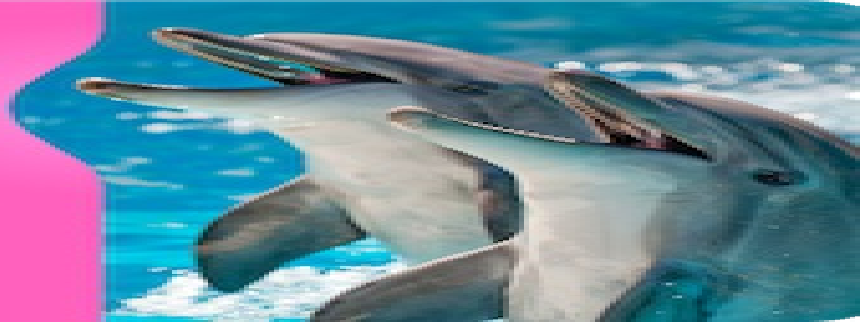
Miami and the Keys Explorer Pass - Pick 4 Attractions Combo