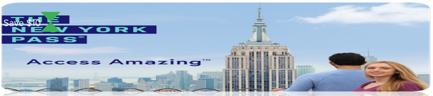
3-Day New York Pass