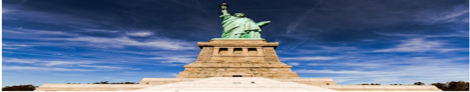
Early Access Statue of Liberty and Ellis Island