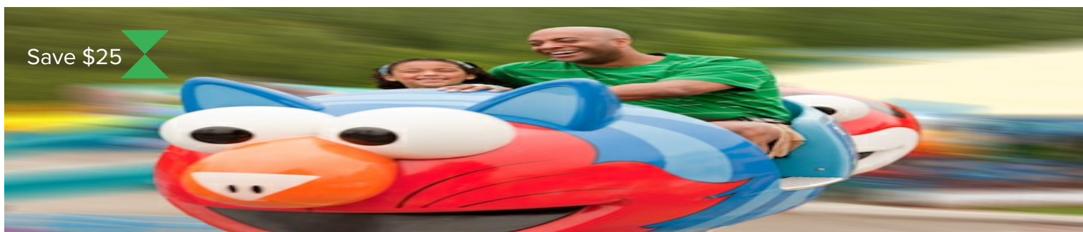
Sesame Place Any Day Ticket with Free 2nd Visit + 1 Meal