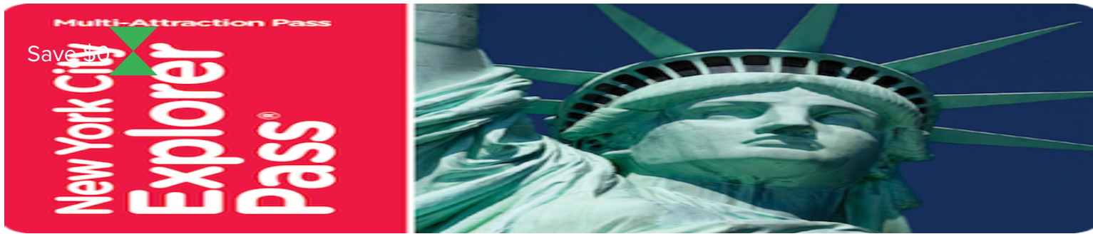
New York City Explorer Pass - 4 Attractions Combo