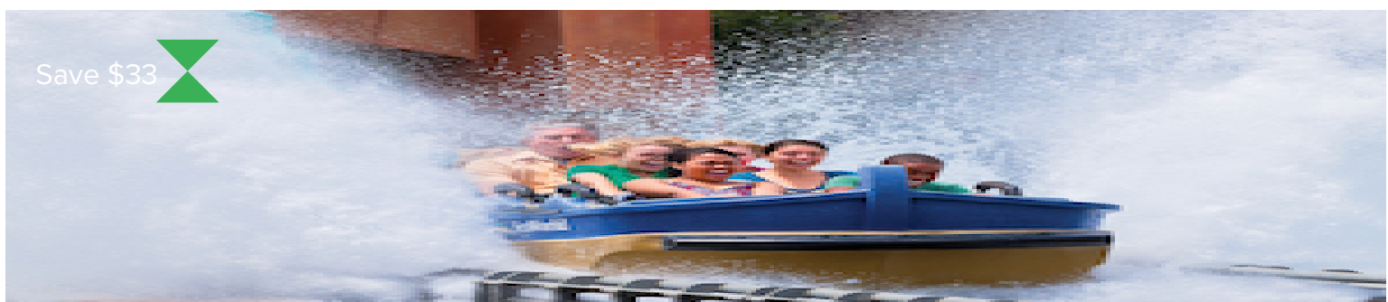
SeaWorld San Antonio and Aquatica 2-Day Flex Ticket (SPECIAL OFFER)