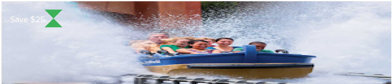
SeaWorld San Antonio Silver Annual Pass