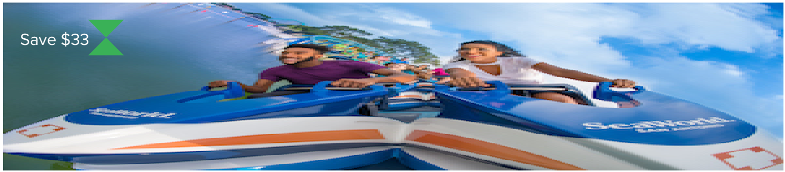
SeaWorld San Antonio and Aquatica 3-Day Flex Ticket (SPECIAL OFFER)