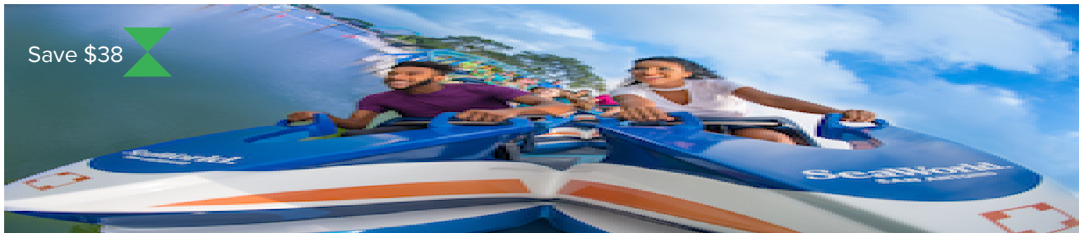
SeaWorld San Antonio Single Day Ticket (SPECIAL OFFER)