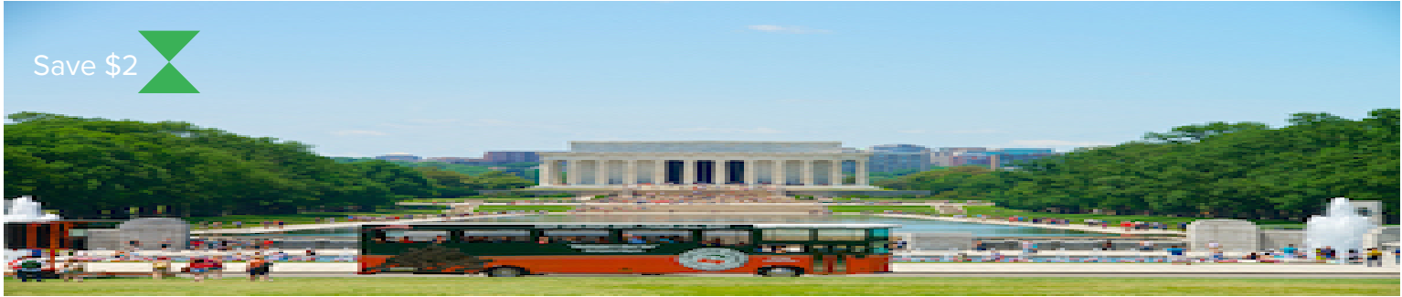
Washington DC Old Town Trolley Tour 1-Day (Silver Pass) Ticket