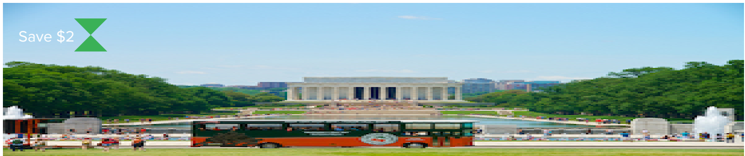
Washington DC Explorer Pass - 3 Attractions Combo