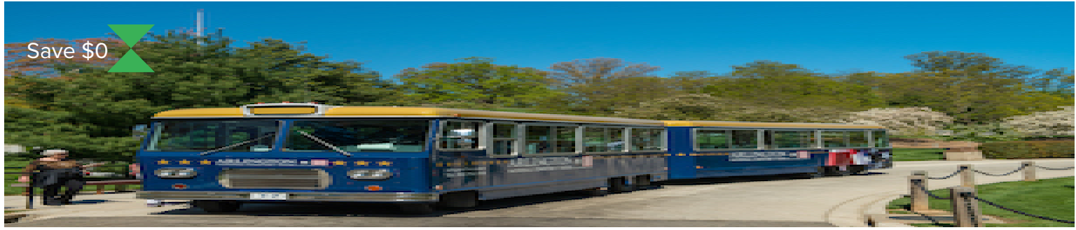
Arlington National Cemetery Tour