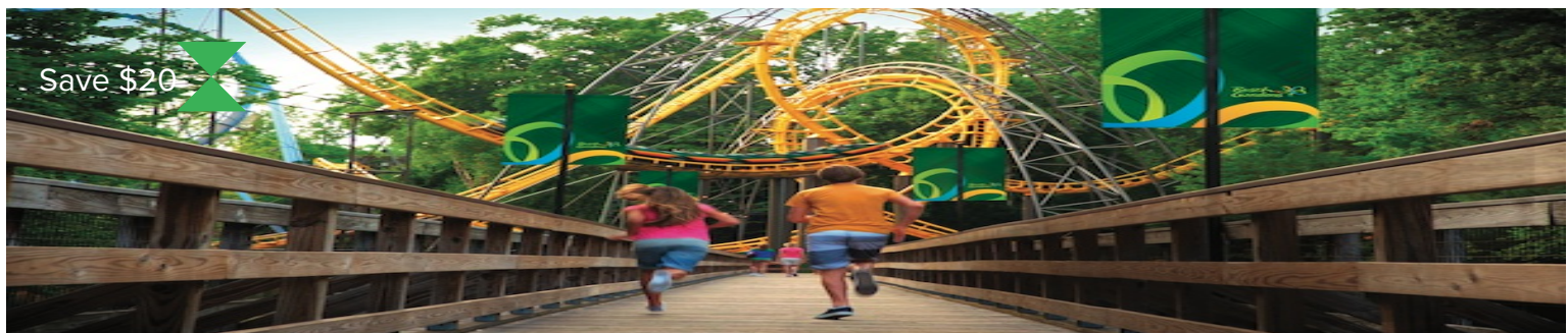
Busch Gardens Williamsburg Single Day Ticket