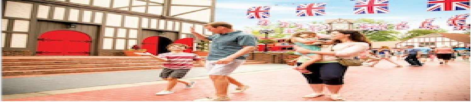
Busch Gardens Williamsburg Unlimited Membership