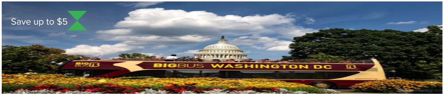
Big Bus Washington DC Hop-on Hop-off Tour